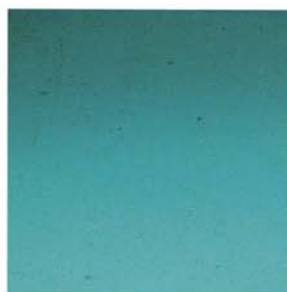
1408 LT. AQUAMARINE BLUE