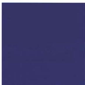
0114 COBALT BLUE