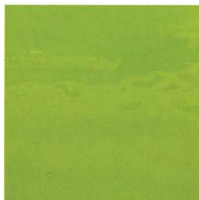
0126 SPRING GREEN